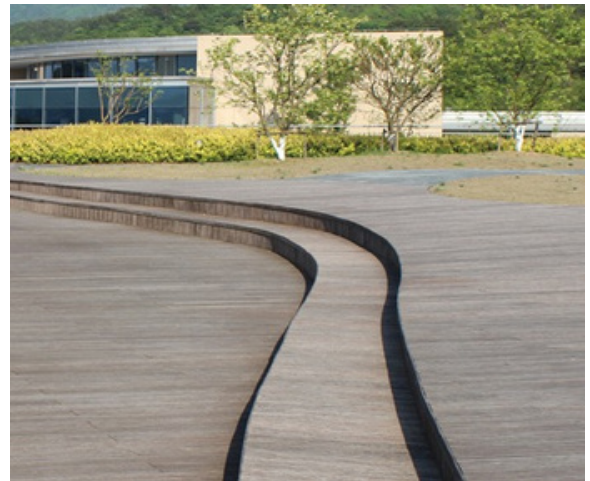
Revisited in 2019