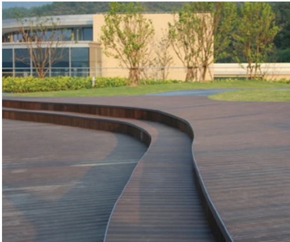
Installed in 2013