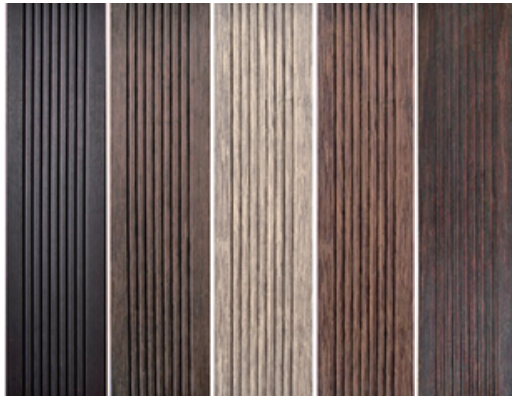
New 6 Months 18 Months After After Cleaning Maintenance